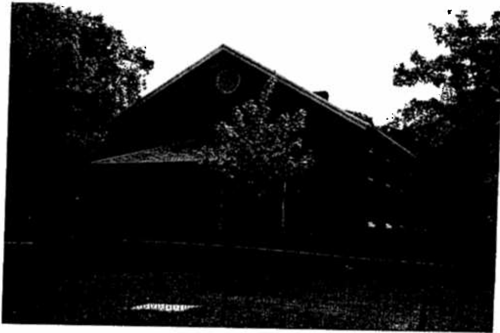
Plate 7. 5017 Peacock Road.