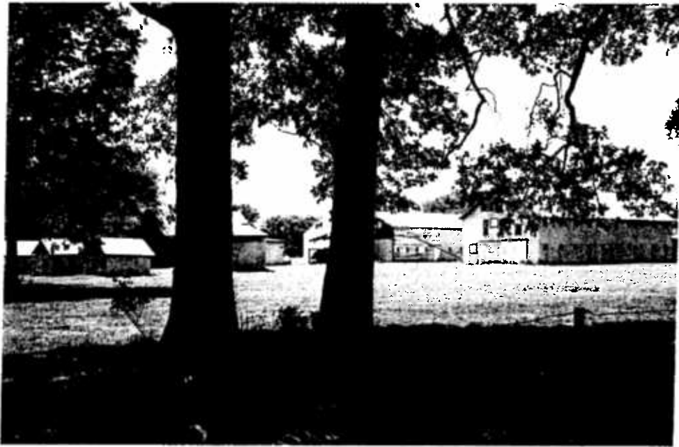
Plate 4. 6736 Tanyard Road, outbuildings.