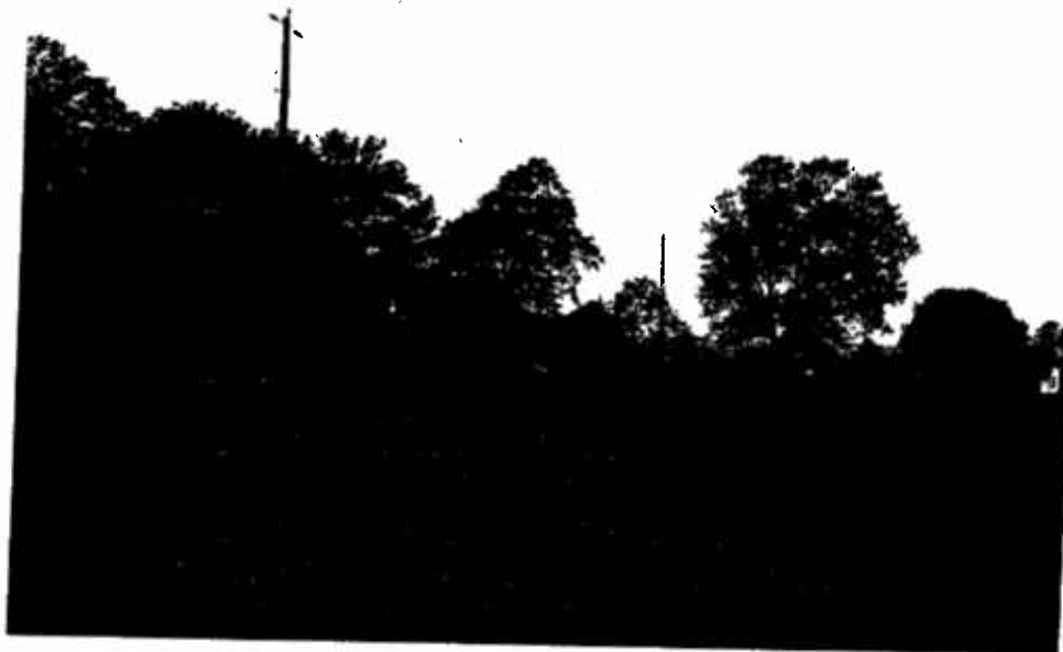
Plate 8. 4863 Peacock Road.