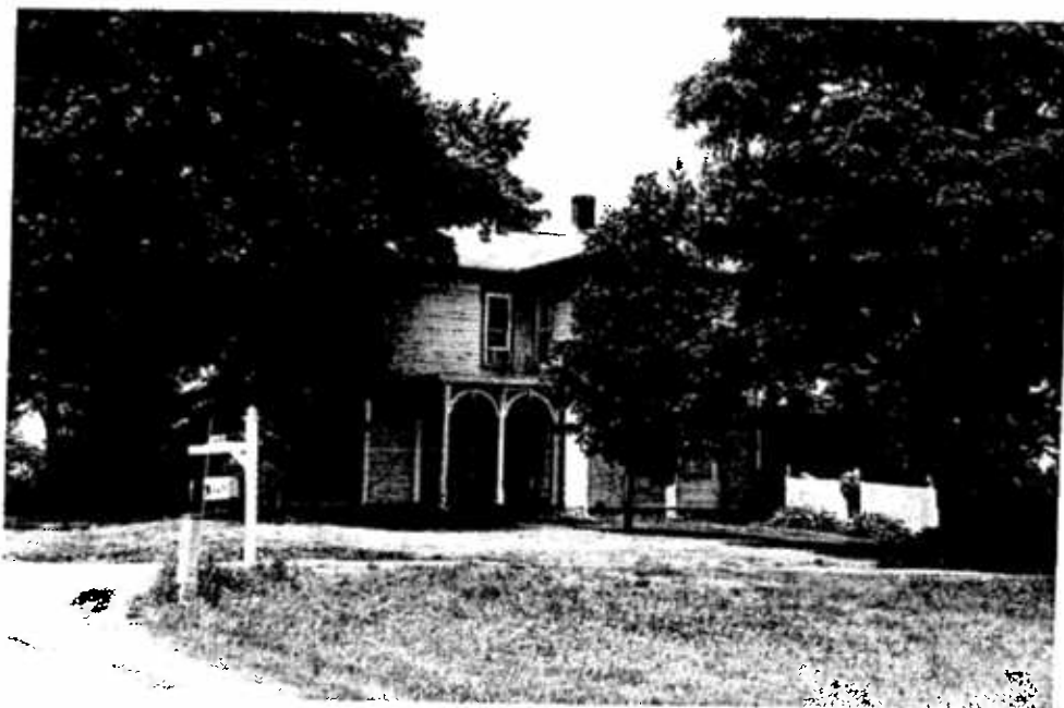
Plate 5. 292 W. Jackson Road.