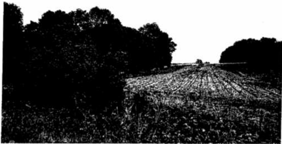
Plate 2. View northeast towards reported location of a mound (Mills 1914).