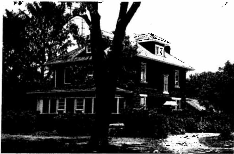
Plate 3. 6736 Tanyard Road, house.