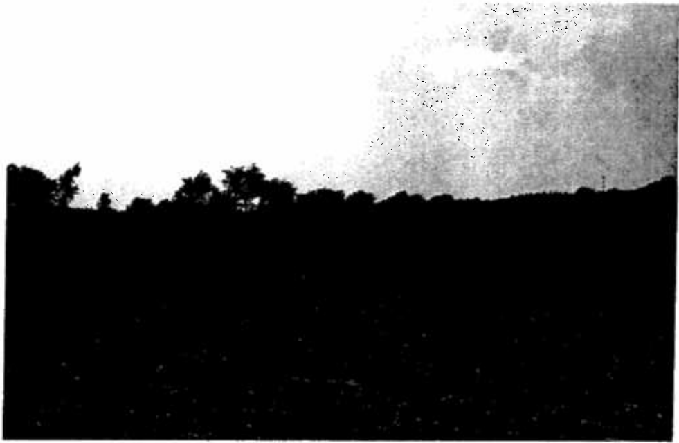
Plate 1. View southwest towards reported location of a mound (Mills 1914).